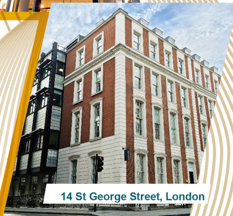
14 St George Street, London