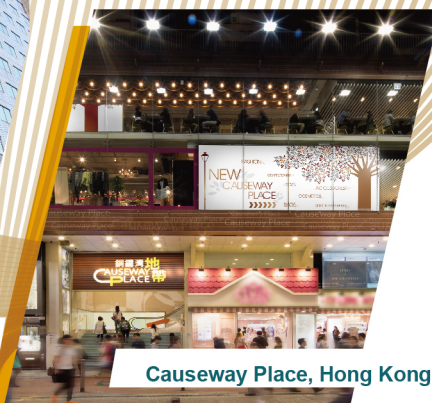
Causeway Place, Hong Kong