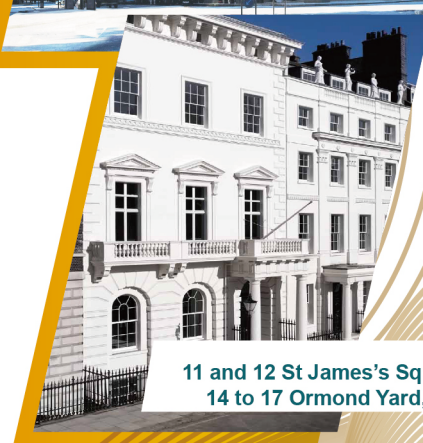
11 and 12 St James's Square and 14 to 17 Ormond Yard, London