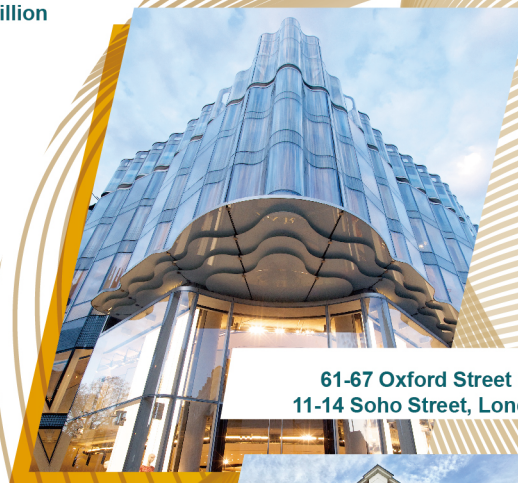
61-67 Oxford Street and 11-14 Soho Street, London