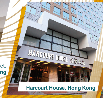
Harcourt House, Hong Kong