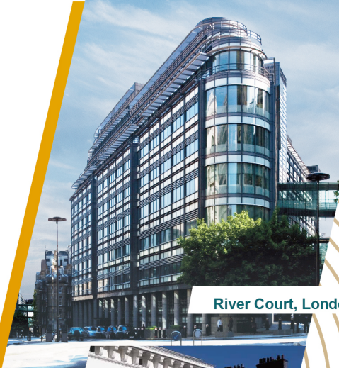
River Court, London