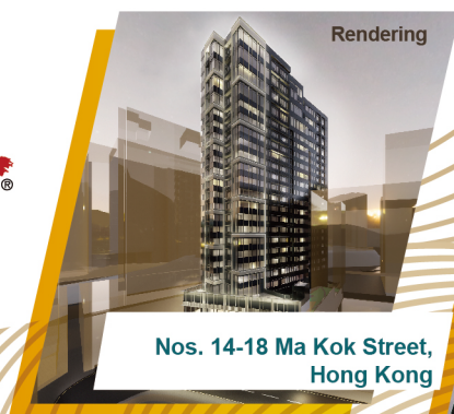
Nos. 14-18 Ma Kok Street, Hong Kong