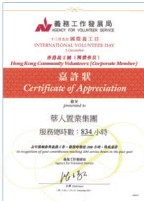
Hong Kong Community Volunteers (Corporate Member) – Certificate of Appreciation 香港義工團（團體會員）—嘉許狀