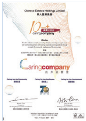
10 Years Plus Caring Company 連續10年或以上獲頒「商界展關懷」標誌