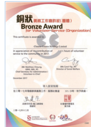
Bronze Award for Volunteer Service (Organization) 義務工作嘉許狀(團體)銅狀