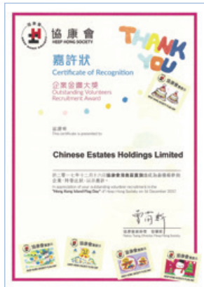
Outstanding Volunteers Recruitment in the "Hong Kong Island Flag Day" of Heep Hong Society on 16 December 2017 – Certificate of Recognition (Outstanding Volunteers Recruitment Award) 二零一七年十二月十六日協康會港島區賣旗日最積極義工參與企業—嘉許狀(企業金鑽大獎)