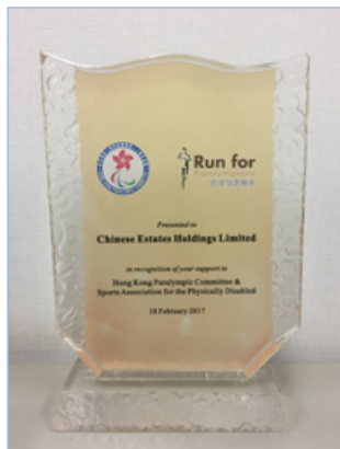
Run for Paralympians Award: Recognition of your support to Hong Kong Paralympic Committee & Sports Association for the Physically Disabled 「齊撐殘奧精英」獎項：香港殘疾人奧委會暨傷殘人士體育協會支持銘謝狀