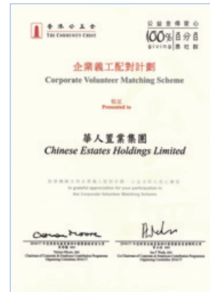
Corporate Volunteer Matching Scheme – Certificate of Appreciation 企業義工配對計劃—銘謝狀