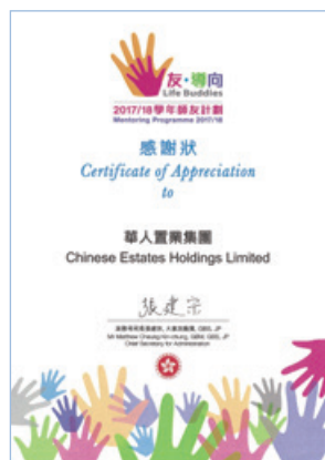
Life Buddies Mentoring Programme 2017/18 – Certificate of Appreciation 友•導向2017/18學年師友計劃—感謝狀