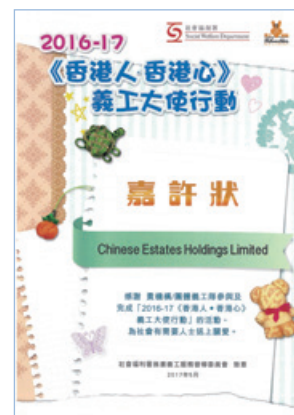
2016-17 “Hong Kong Citizen Hong Kong Heart” Volunteer Ambassador Program – Certificate of Appreciation 2016-17《香港人•香港心》義工大使行動—嘉許狀