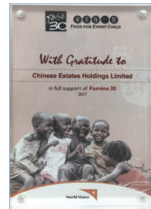
With Gratitude to Chinese Estates Holdings Limited in full support of "Famine 30" 鳴謝華人置業集團全力支持「饑饉30」