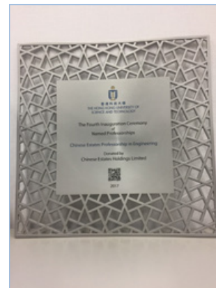
Donation to HKUST Named Professorships Program – Chinese Estates Professorship in Engineering 贊助香港科技大學冠名教授席 —華人置業工程學教授