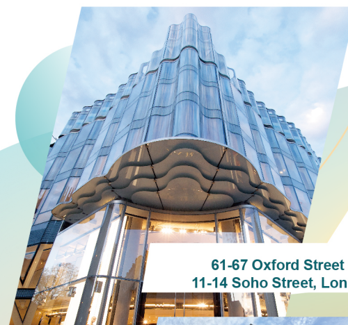
61-67 Oxford Street and 11-14 Soho Street, London