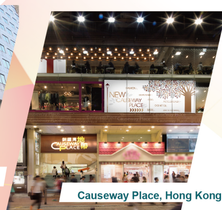
Causeway Place, Hong Kong