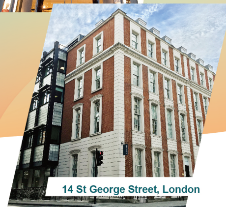
14 St George Street, London