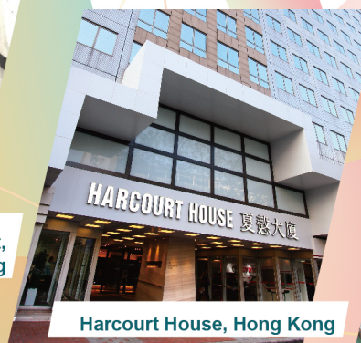
Harcourt House, Hong Kong