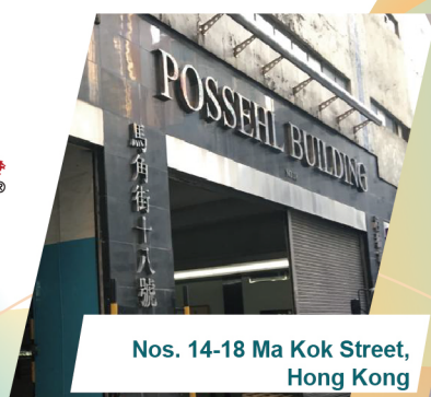
Nos. 14-18 Ma Kok Street, Hong Kong