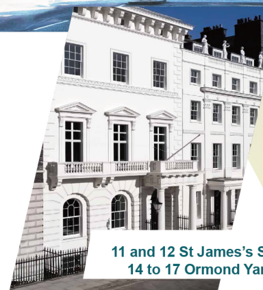
11 and 12 St James's Square and 14 to 17 Ormond Yard, London