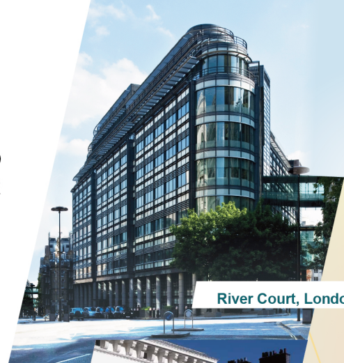
River Court, London

The information contained herein does not constitute a statutory results announcement. The results announcement is published on the Company's website at http://www.chineseestates.com and the HKEXnews website at http://www.hkexnews.hk